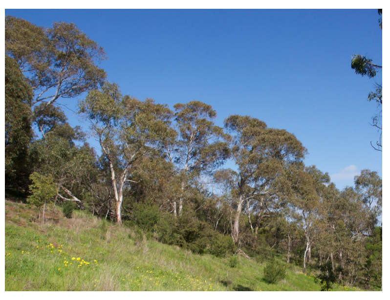
The site for the western tunnel portal will result in the loss of one of the few remaining fragments of natural vegetation.

The proposed East West Link project will not simply build new infrastructure. It will destroy irreplaceable infrastructure that is vital to support urban growth and consolidation in the inner city area. AILA implores Mr Abbott and the Victorian Government to aspire to the vision of La Trobe, and to protect and enhance this vital piece of parkland.