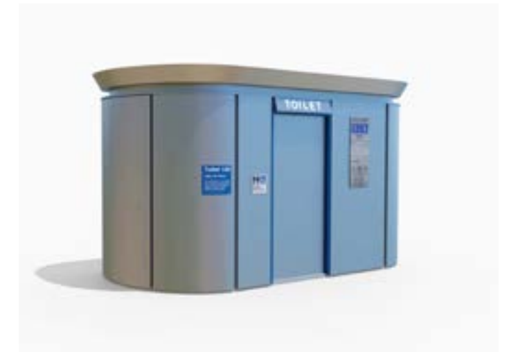
Proposed Exeloo Toilet