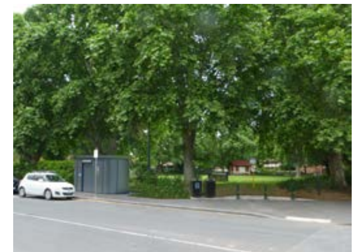
Gardiner Reserve Proposal - Artist's Impression