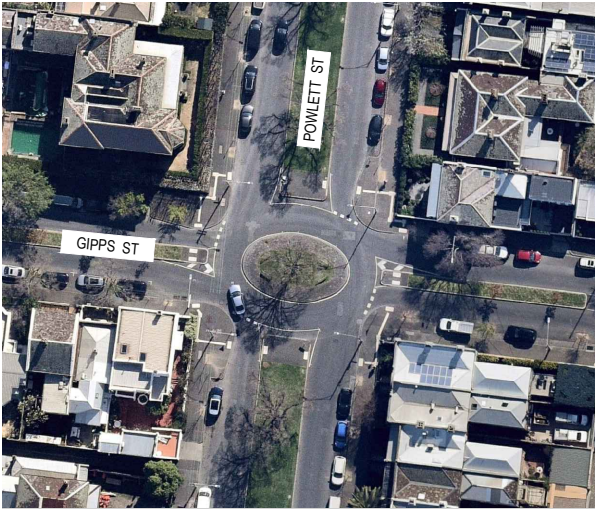
POWLETT ST - GIPPS ST