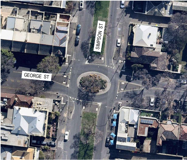
SIMPSON ST - GEORGE ST