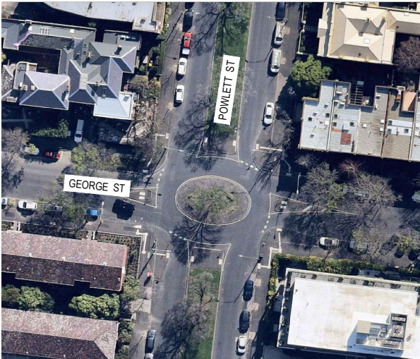
POWLETT ST - GEORGE ST

Rev A - 05/04/2022 - Preliminary to client