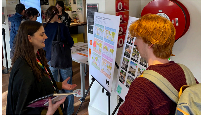
Community Pop-Up at Kathleen Syme Library