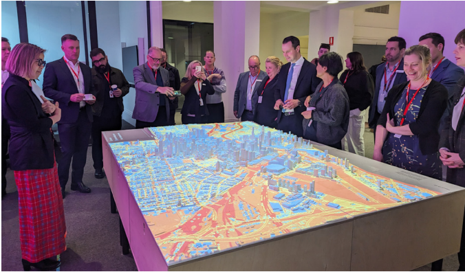
Our CityDNA in action at the Melbourne Town Hall