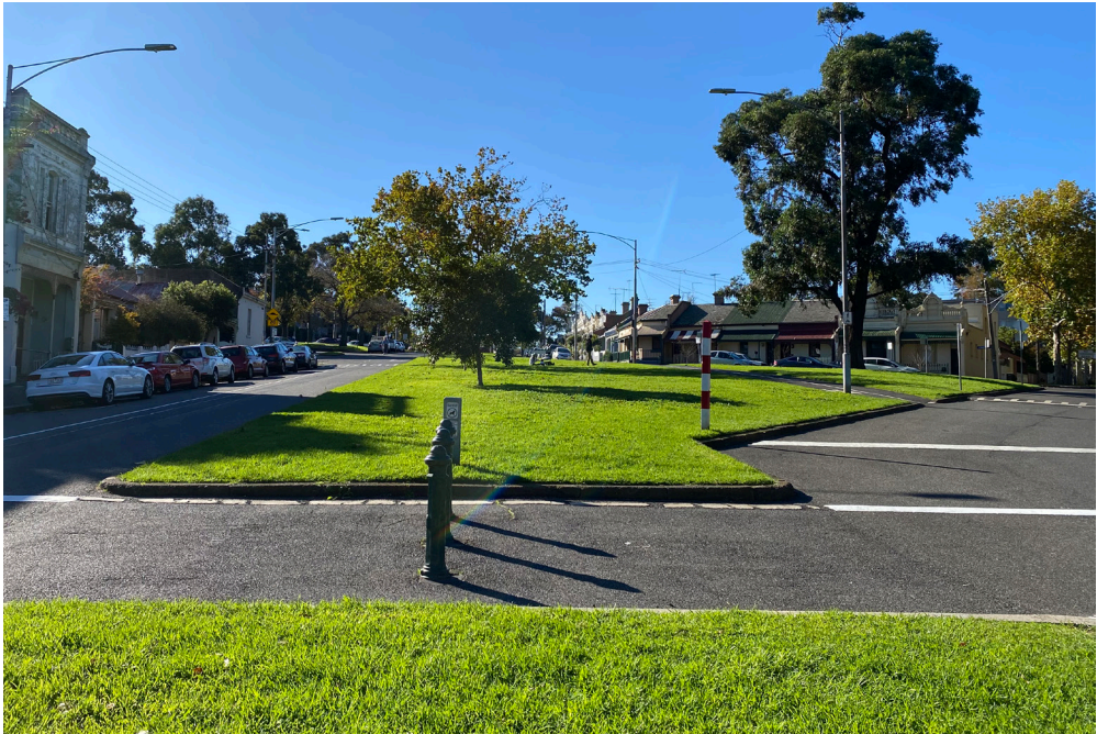
EXISTING VIEW NORTH ALONG ERROL STREET