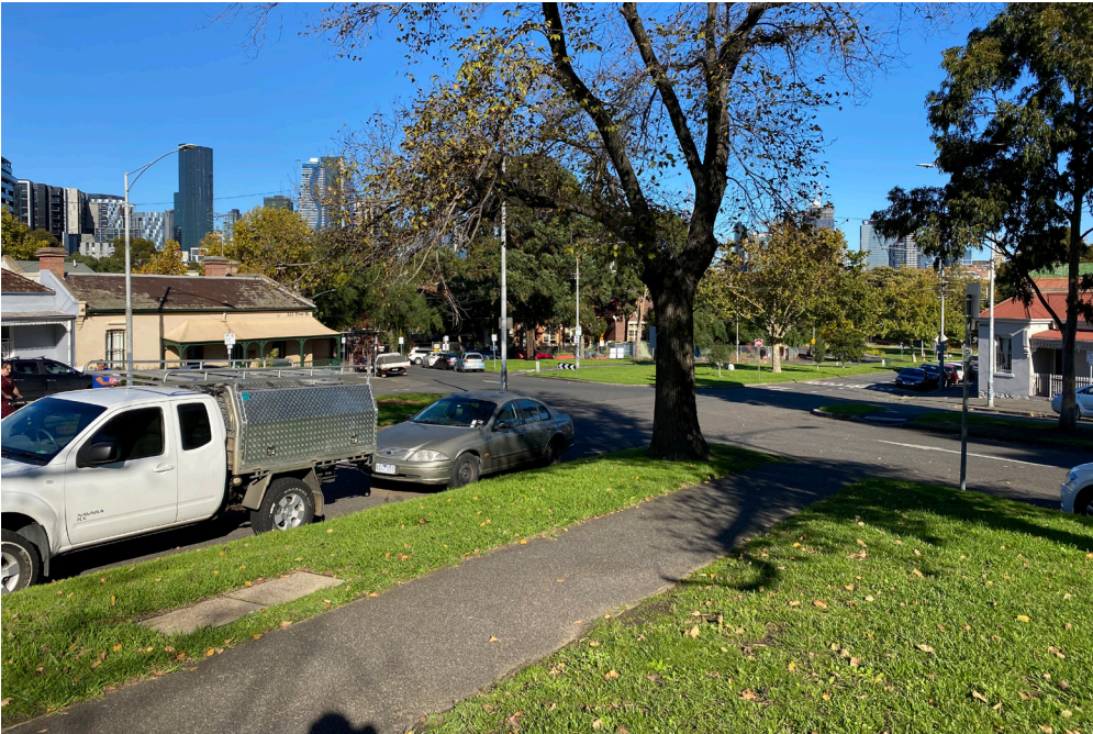
EXISTING VIEW SOUTHEAST ALONG ERROL STREET