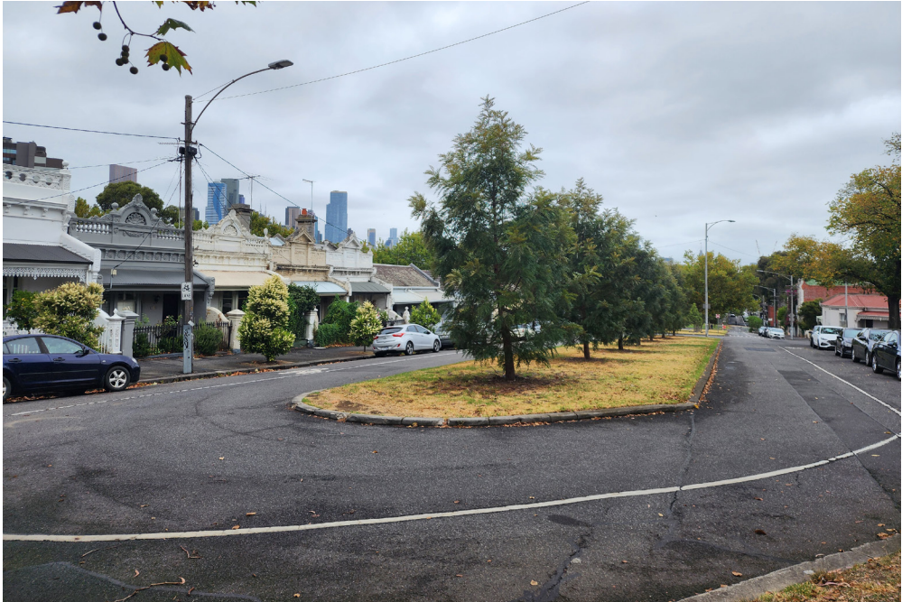
EXISTING VIEW SOUTH ALONG ERROL STREET