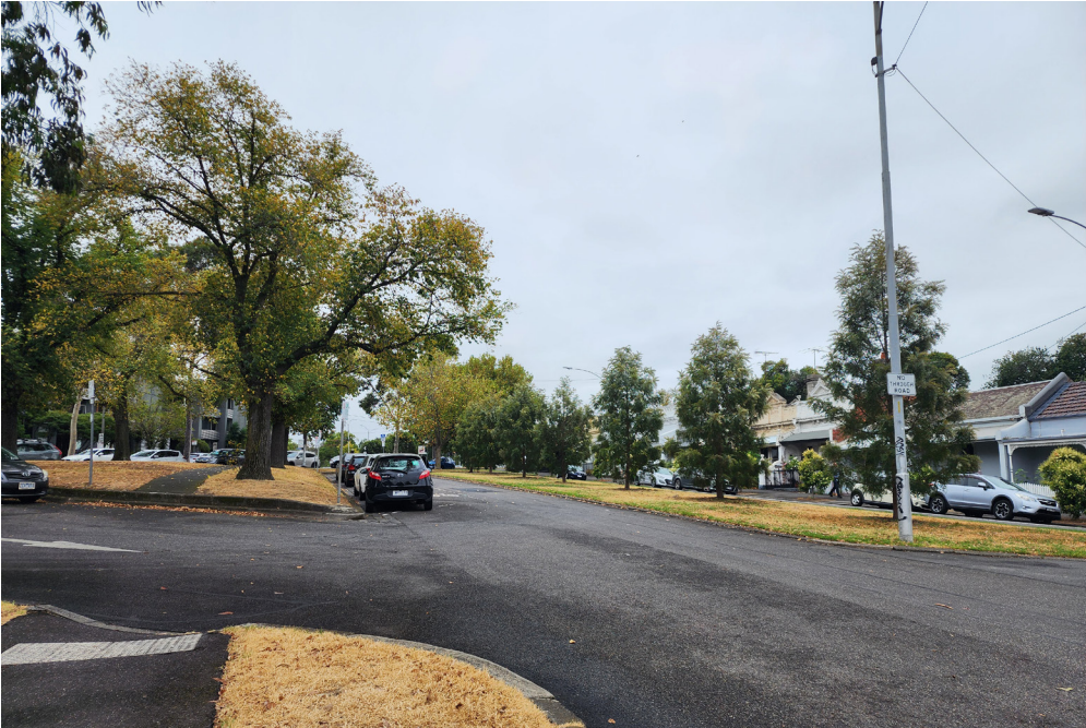
EXISTING VIEW NORTH ALONG ERROL STREET

WE WOULD LIKE TO HEAR YOUR THOUGHTS ON THIS PROPOSED EXPANSION, AND WHAT YOU WOULD LIKE TO SEE IN THE EXPANDED PARK.