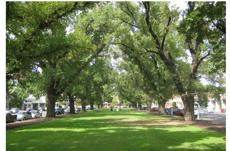
Existing conditions Macarthur Square - looking east

This would result in the loss of approximately 5 car parking spaces from Macarthur Square.