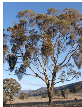
Eucalyptus melliodora / Yellow Box