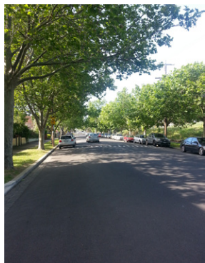
Platanus x acerifolia / London Plane