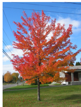
Acer rubrum / Red Maple