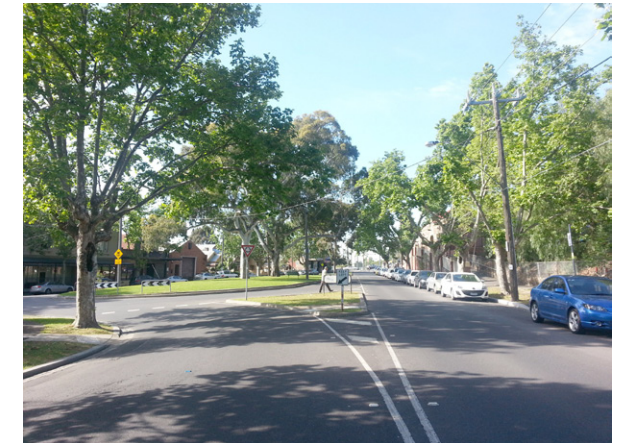
View 1. Looking south along Eastwood Street showing existing 'leafy green' landscape character.