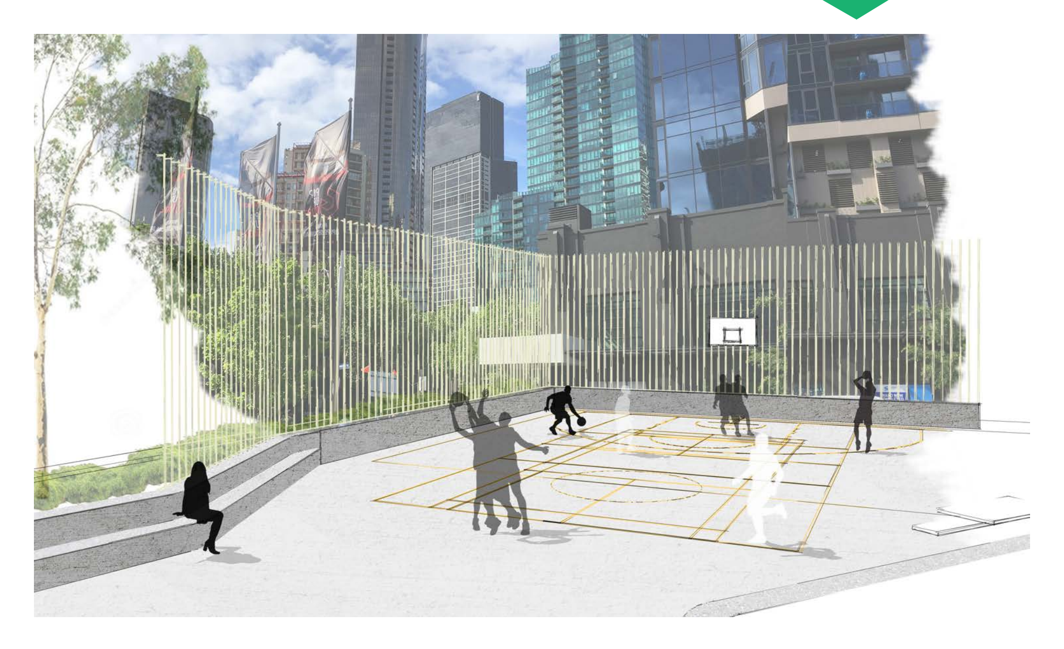
The City Road frontage will be adapted to provide a multipurpose sports court to bring activity to the front of the Boyd site.