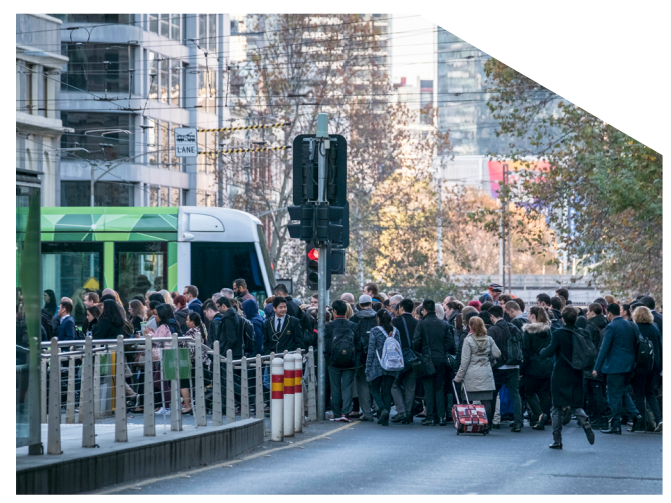
Pedestrians squeeze across Collins Street pedestrian crossing

Space in the city is limited and under increasing pressure. A disproportionate amount of space is allocated for private vehicles in the central city, relative to the transport role these vehicles serve. Residential, worker and visitor populations in the central city continue to grow and are placing increasing pressure on public space. Pedestrian overcrowding leads to poor experiences of our city and particularly affects more vulnerable users. Negotiating crowds in a wheelchair or with a pram can be especially difficult.