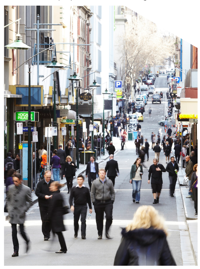
People walk down Little Collins Street during lunchtime