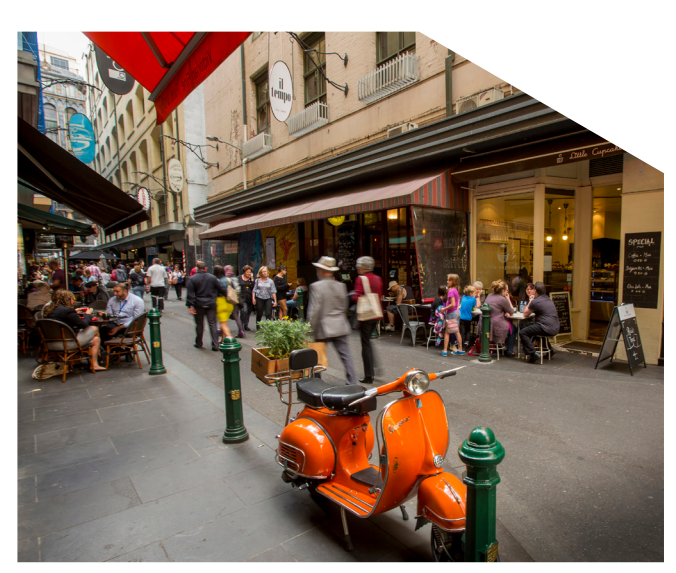
Street dining along Degraves Street

Over the last 30 years, the City of Melbourne has improved the quality of our streets creating vibrant, productive, inclusive and enjoyable places. Our streets are critical to the city's liveability, environmental sustainability, economic prosperity and international reputation. We have created more places for walking, shopping, sitting, connections for business and dining by repurposing excess road space.