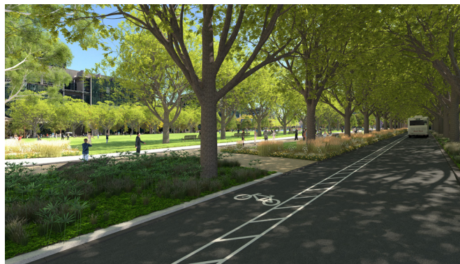
Leicester Street "road within a park"