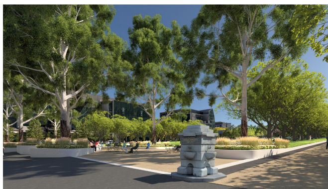
Pelham Street plaza and park entry