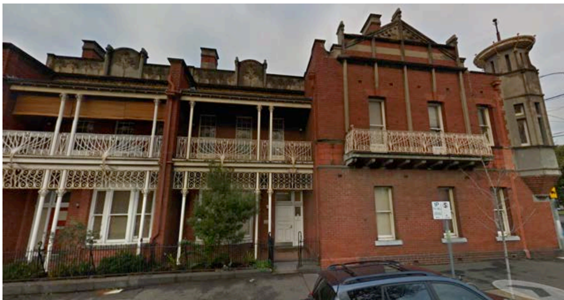
Figure 4.3 – Eastbourne House, building at the corner of Wellington Parade at right, '8 & 10 Simpson Street' at left

Consistent with the methodology, the 'A' grading previously assigned to 8 & 10 Simpson Street means a Significant grading should be applied to whole of this building.