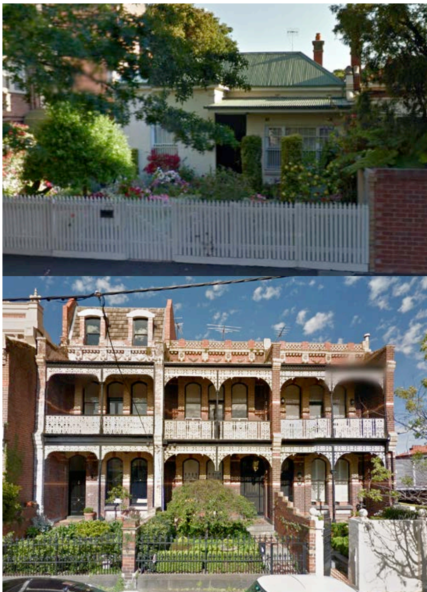
Figure 4.4 – 33 Albert Street (above) and 18 Berry Street (below, at left)