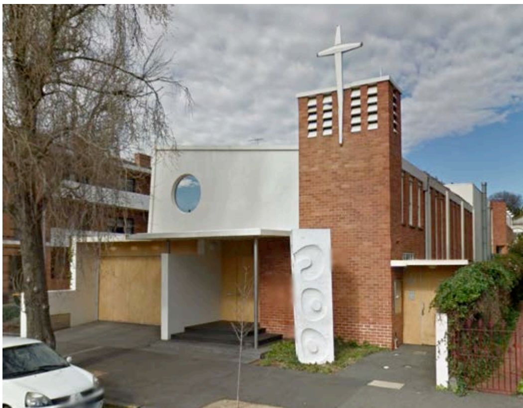
Figure 4.2 – Former St Mark's Lutheran Church