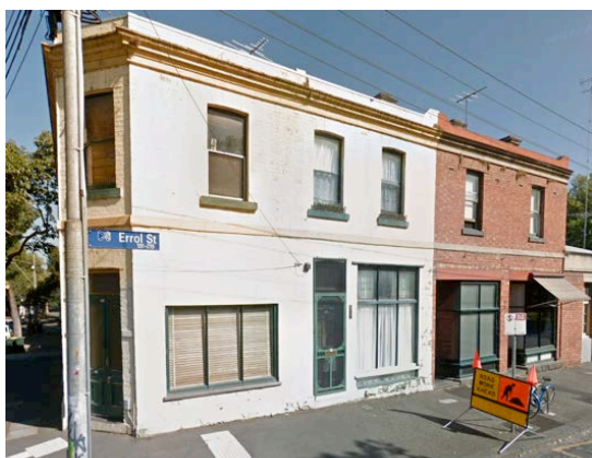
Figure 3.1 – 191-197 Errol Street.