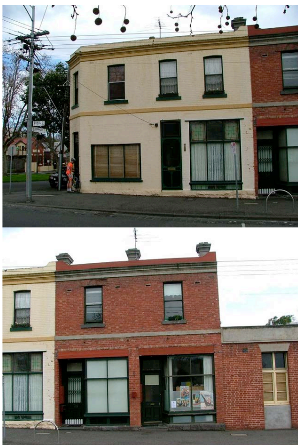
Figure 3.2 – i-Heritage images for '193 Errol Street' (top) and '195 Errol Street' (below)