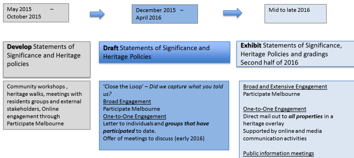
Figure 4 - Slide presented to the Future Melbourne Committee of 5 July 2016