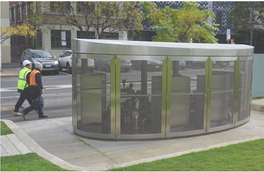
EXAMPLE OF PUMP & CONTROL SYSTEM (Lincoln Square) LOCATION TO BE DETERMINED