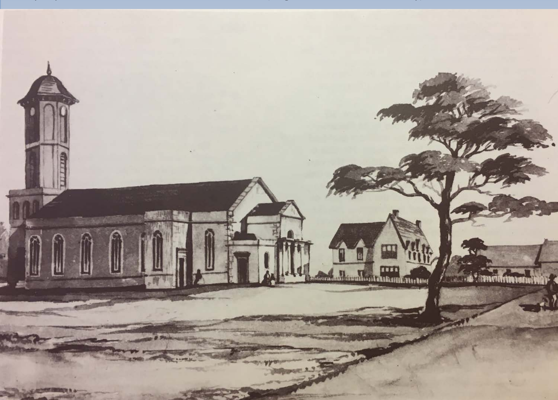
Early depiction of the Cathedral and its bell tower (original in the LaTrobe Library)