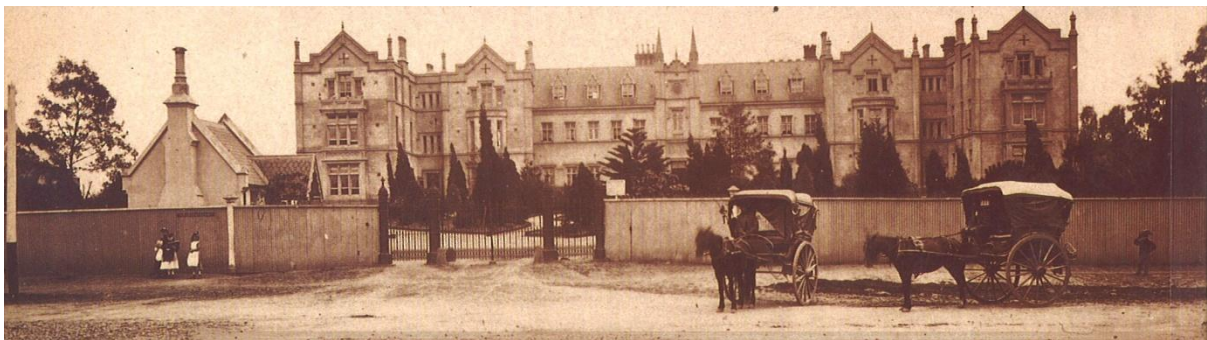
Benevolent Asylum Curzon St facade c. 1890

The Asylum Estate is historically important as it occupies the site of the former Victoria (later Melbourne) Benevolent Asylum, the first permanent building in North Melbourne and a landmark building of early Melbourne. This Edwardian and inter-war estate is on a government model subdivision developed after the demolition of the Asylum in 1911 and we argue that it is historically significant as a large subdivision of early 20 th century housing in the inner city set amidst a Victorian precinct. The Asylum Estate is half in North Melbourne and half in West Melbourne. Victoria Street was extended after the demolition of the Asylum and forms the boundary between the two suburbs. Refer to Plan on page A4 for scope of the Estate