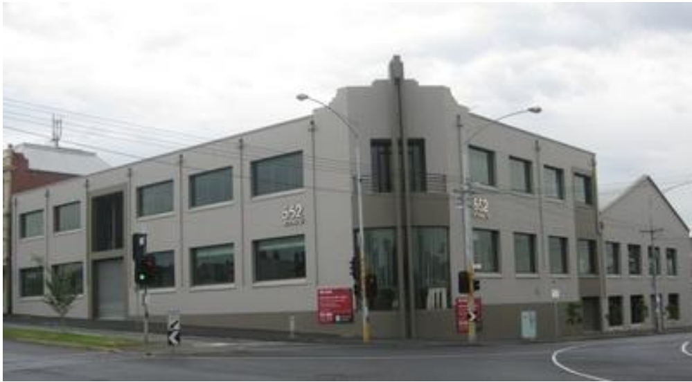
552-68 Victoria St

northeast corner of Miller and Abbotsford Streets, has been extensively, but more appropriately, renovated and has been assessed as 'Significant' in the West Melbourne Heritage Review (although it does not appear to be listed in the City of Melbourne's i-heritage data base).