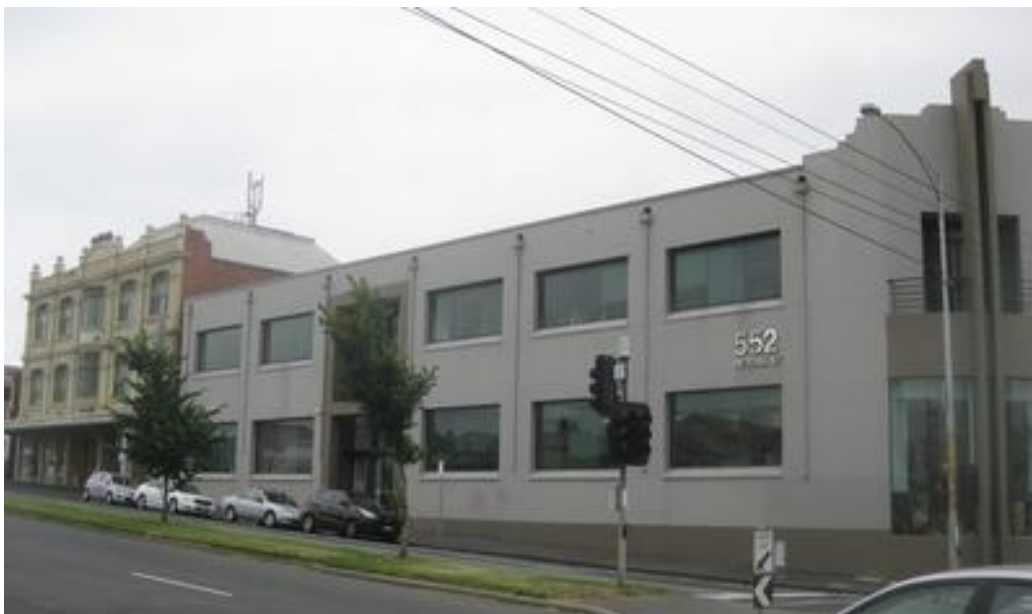
Victoria St facade of 552-68 Victoria St showing adjacent Loco Hall

The corner site is very sensitive. It could be regarded as the gateway to the Asylum Estate. It directly abuts the 'Significant' building known locally as the Loco Hall at 570-78 Victoria Street. These two buildings and the factory site at 60-80 Miller Street are two to three storeys and are the largest and highest on the four hectare estate.