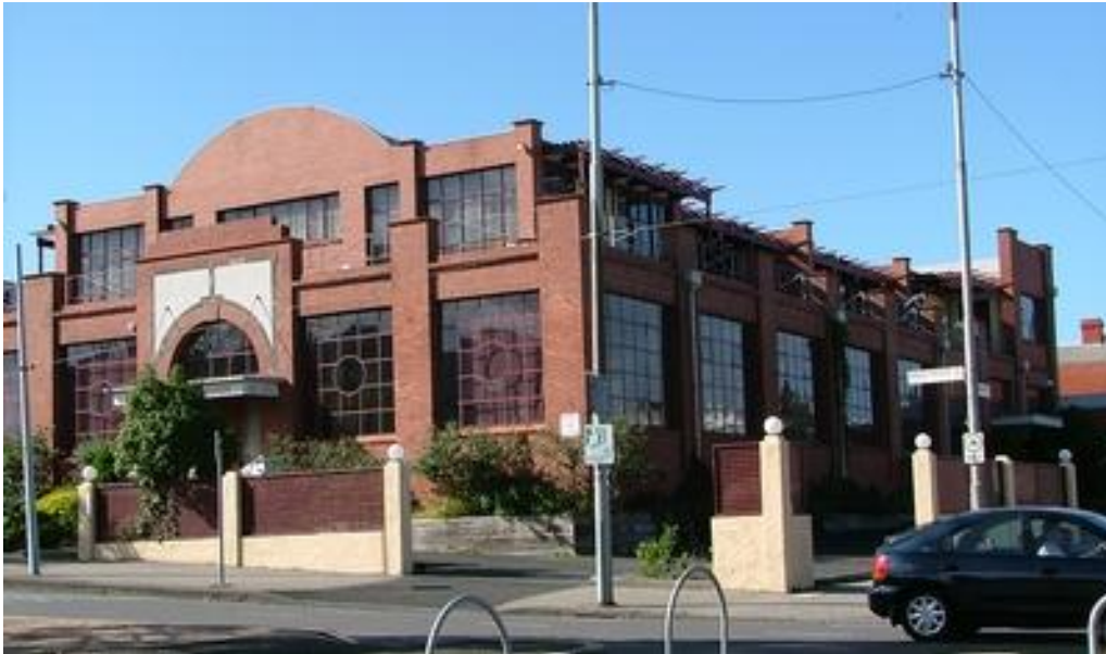
60-80 Miller St, West Melbourne, originally The Britannia Tie Company factory

We have been informed that some home owners adjacent to a long unoccupied property on the western edge of the Estate have been approached to sell their properties to enable amalgamation of blocks. We are all aware of the potentially destructive power of precedent. If the old factory building at 552 Victoria Street is permitted to be demolished and a medium rise building erected, the entire predominantly single storey residential estate could be vulnerable.