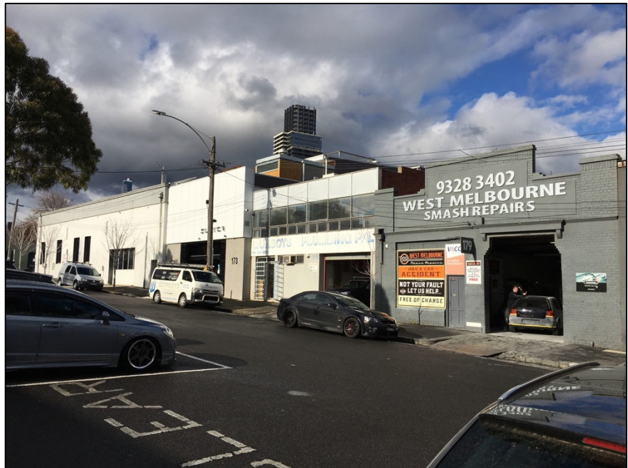
Figure 6 Along Stanley Street, opposite the subject site, facing east.