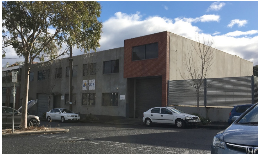
Figure 2 218-228 Stanley Street, as viewed from the southeast. The property contains a two storey modern concrete and brick office building of no heritage interest.