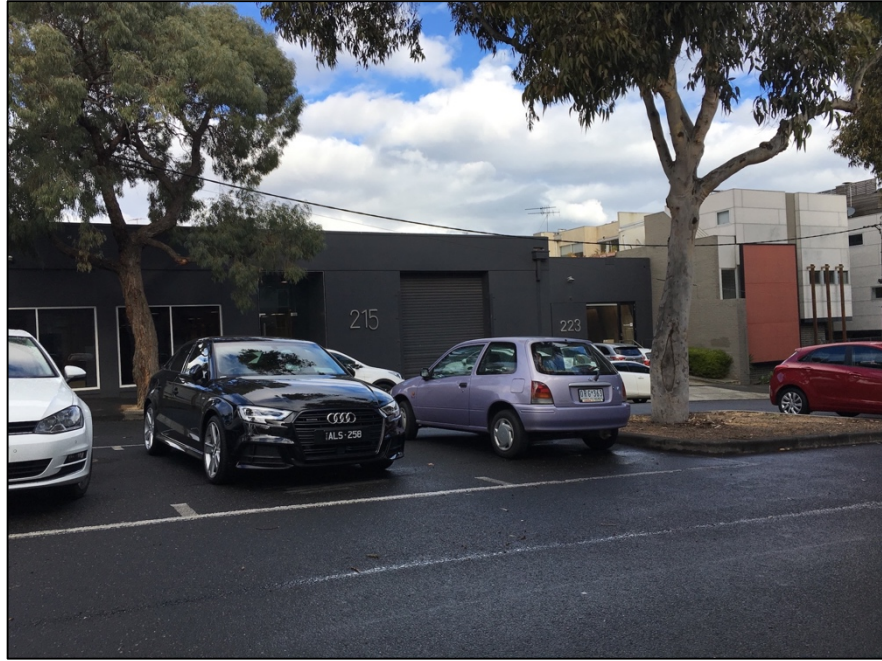
Figure 9 215-223 Roden Street contains a single storey modern office/factory building of no heritage interest.