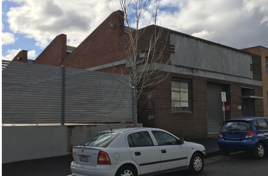
Figure 1 The interwar brick factory building at 210-212 Stanley Street, as viewed from the southwest.