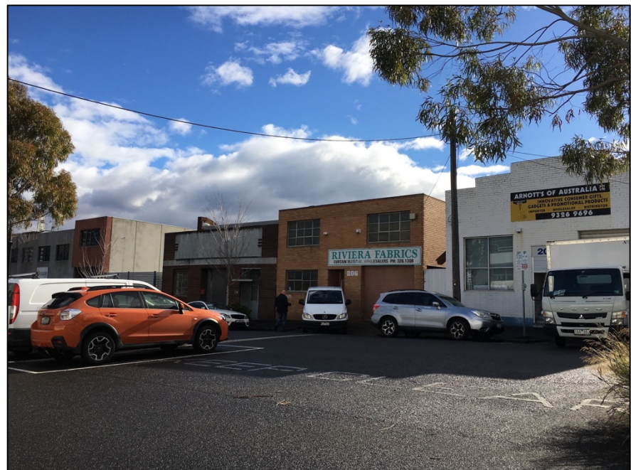
Figure 4 Adjacent to the east of 210-212 Stanley Street are brick factory buildings at 206-208 and 202 Stanley Street.