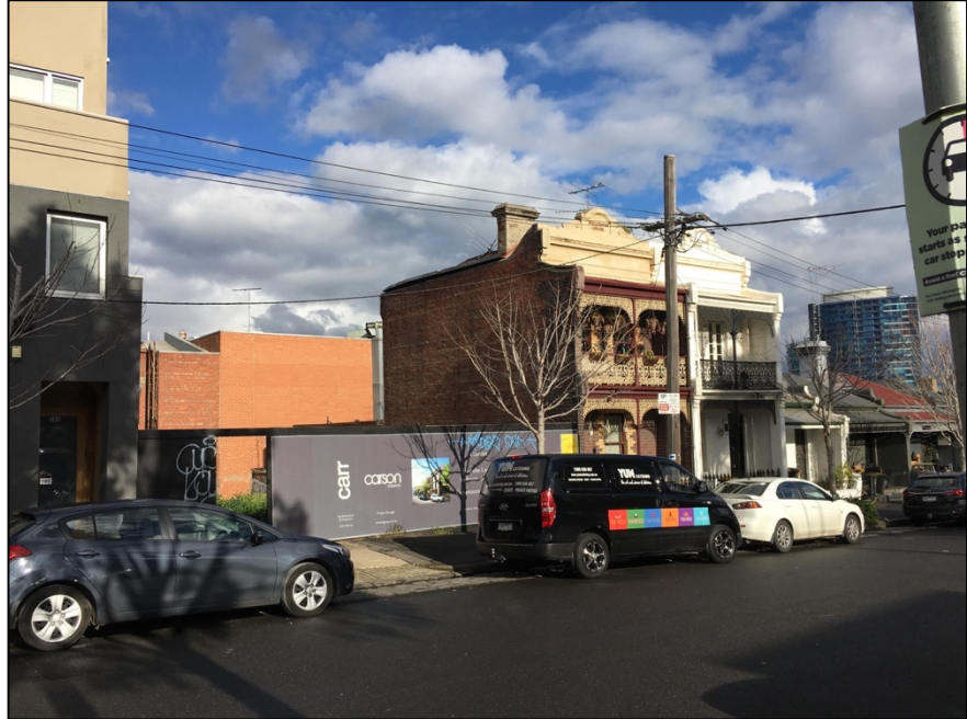
Figure 7 Along Stanley Street, opposite the subject site facing west.