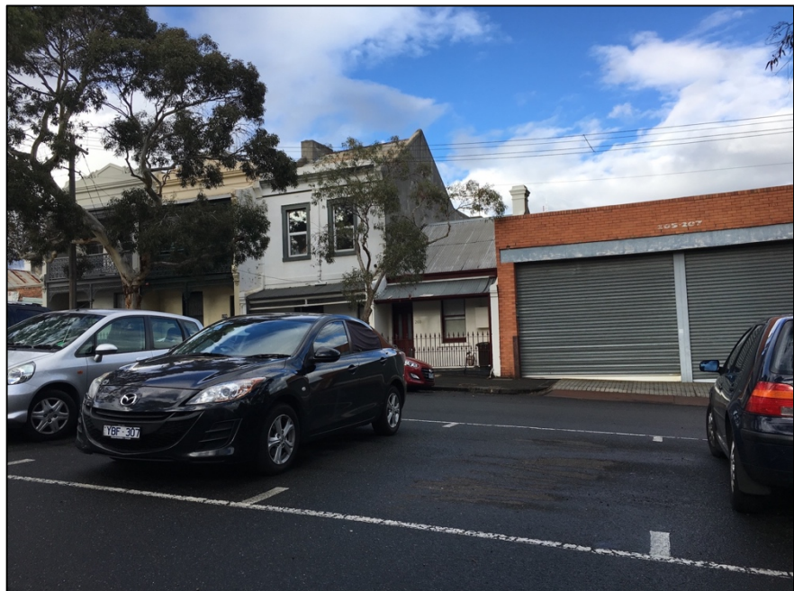
Figure 8 Along Roden Street, adjacent to the east of the site, the land at 203 Roden Street contains a single storey terrace dwelling, with three two storey terrace dwellings extending east of that.