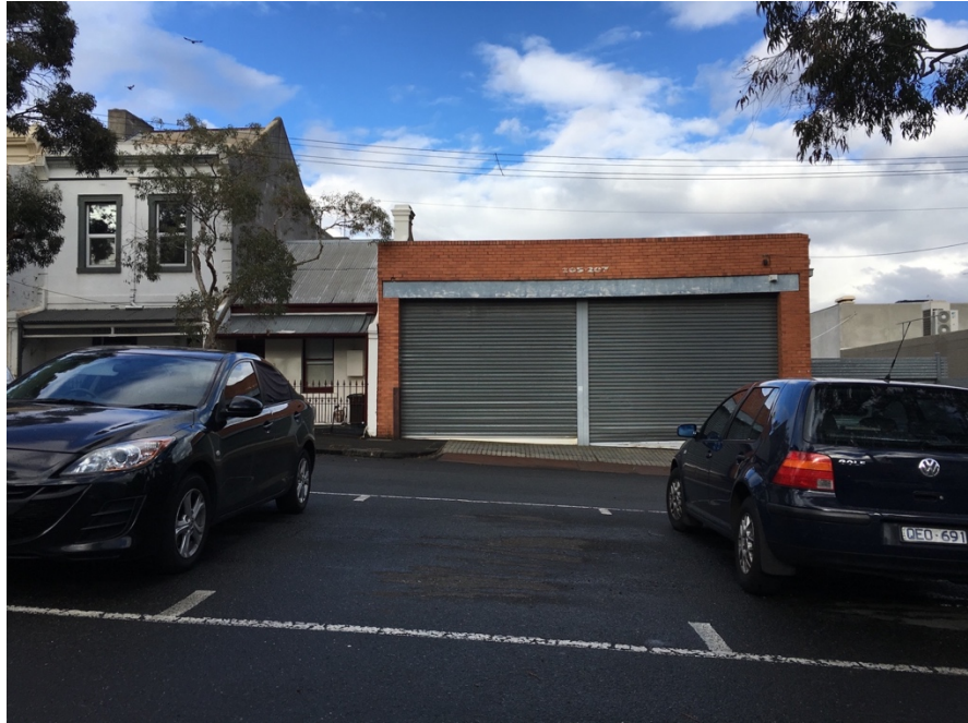
Figure 3 205-211 Roden Street, as viewed from the north. The property contains a single storey red brick warehouse, with a flat roof clad in corrugated iron.