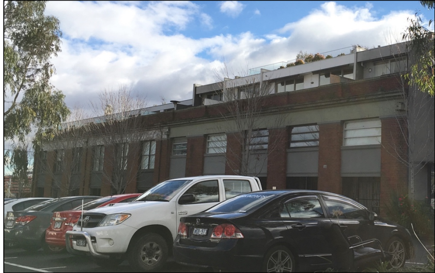
Figure 5 230-250 Stanley Street is a former two storey warehouse that has been converted into three storey townhouses. It presents to the street as two distinct but similar developments, 230-238 and 240-250 Stanley Street.