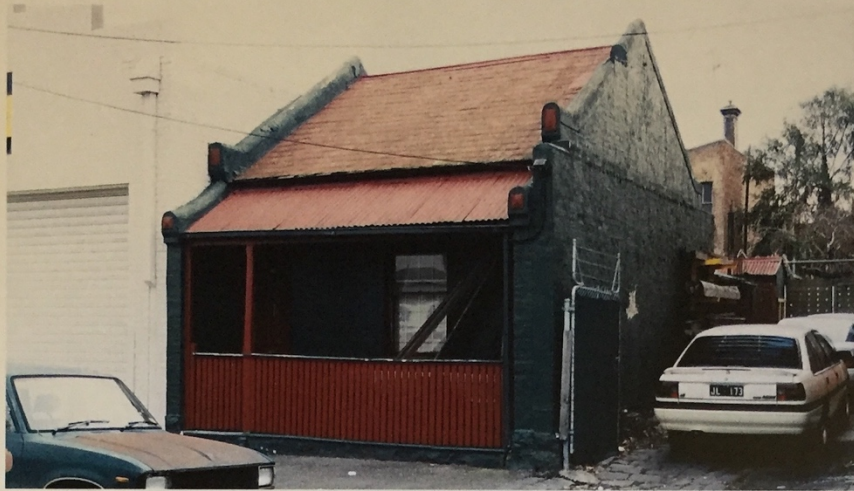
Survey Date July 1999 (previous survey date 9 January 1985)

Intactness Good Fair Poor Condition Good Fair Poor