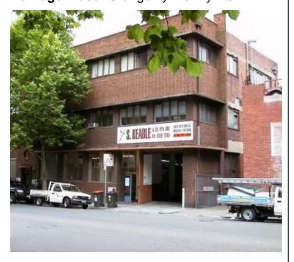
Heritage Place: Grange Lynne Pty Ltd