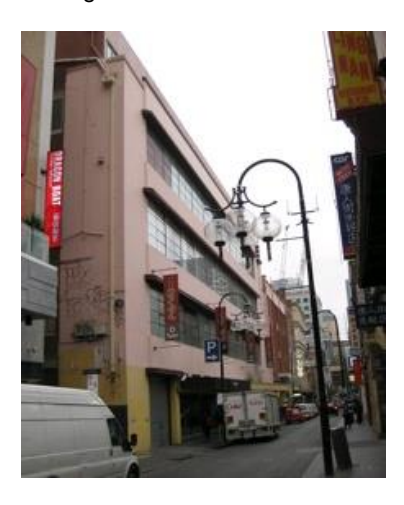
Figure 1. Rear of Target Centre at 222-244 Bourke Street, 209-225 Little Bourke Street, constructed 1937.

222-244 Bourke Street is an amalgamation of two buildings 222-236 Bourke Street, a purpose-built department store built in 1935, and 238-244 Bourke Street, formerly a cinema. The two buildings were incorporated in 1978 and extensively refurbished in 1995. To the rear, the Little Bourke Street frontage at 209-225 Little Bourke Street retains part of a c1937 building.