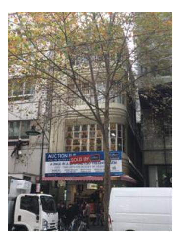
Figure 2. 220 Bourke Street constructed in 1937.

Yule House, 309-311 Little Collins Street, 1932 (HO703)