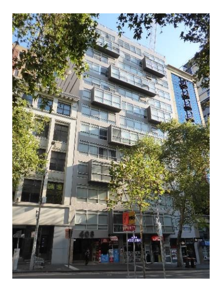
Former AMP Building, 402-408 Lonsdale Street (Bates Smart & McCutcheon, 1956-59).