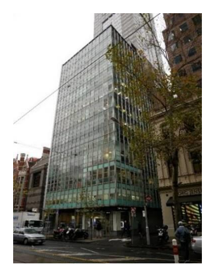
Former Gilbert Court, 100-104 Collins Street (John A La Gerche, 1954-55) included in HO504 Collins East Precinct as a Significant place.

As only a piece-meal evaluation of postwar buildings within the Hoddle Grid in the City of Melbourne has previously occurred, few buildings from the early postwar period are currently included in the Heritage Overlay of the Melbourne Planning Scheme. Those designed in the 1950s that are included in the Heritage Overlay are currently included as part of Heritage Precincts, but are recommended for inclusion in the Heritage Overlay as Individual Heritage Places. These places are: