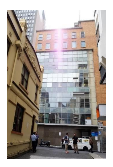
Former Batman Automatic Telephone Exchange, 376 Flinders Lane (Commonwealth Department of Works, 1957).