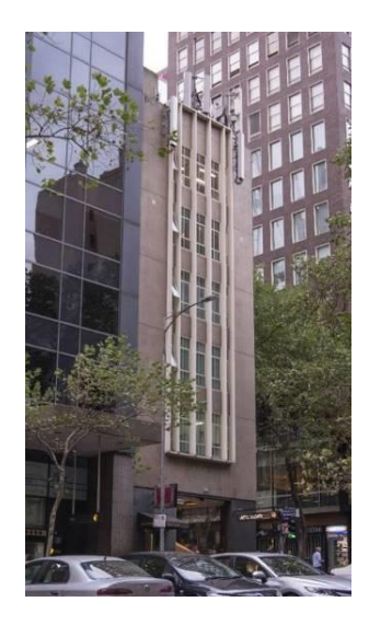
Former Ajax House, 103-105 Queen Street (HD Berry, 1956).