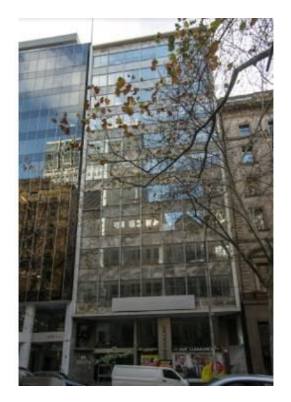
Former Atlas Assurance Building, 404-406 Collins Street (H Garnet Alsop & Partners, 1958-61) (Interim HO1008).