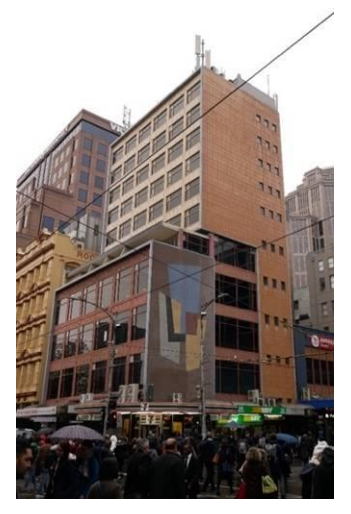
Former Hosie's Hotel, 1-5 Elizabeth Street & 288-290 Flinders Street (Mussen McKay & Potter, 1954-55), included in HO505 Flinders Gate Precinct as a Significant place.