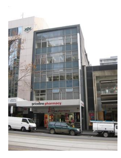
Coles & Garrard Building, 376-378 Bourke Street (Meldrum & Noad, 1957).