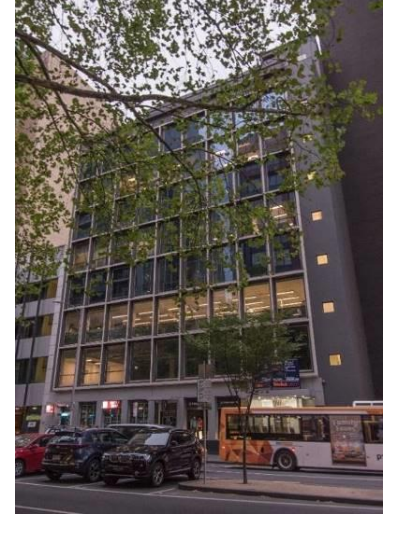
HC Sleigh Building, 166-172 Queen Street (Bates Smart & McCutcheon, 1953-55).