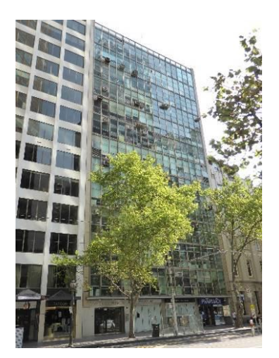
Coates Building, 18-22 Collins Street (John A La Gerche, 1958-59) included in HO504 Collins East Precinct as a Significant place.