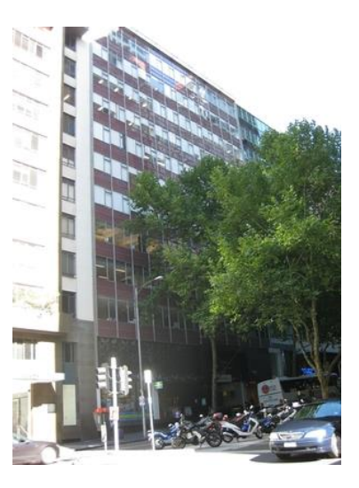
Canton Insurance Building, 43-51 Queen Street (Bates Smart & McCutcheon, 1957).