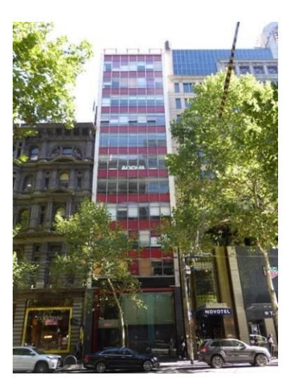
Former Allans Building, 276-278 Collins Street (Godfrey & Spowers, Hughes, Mewton and Lobb with Charles N Hollinshed, 1956-57) included in HO502 The Block Precinct as a Significant place.