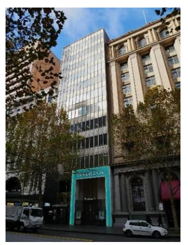
Former Bank of Adelaide Building, 265-269 Collins Street (Godfrey & Spowers, Hughes, Mewton & Lobb, 1959-60) included in HO502 The Block Precinct as a Contributory place.