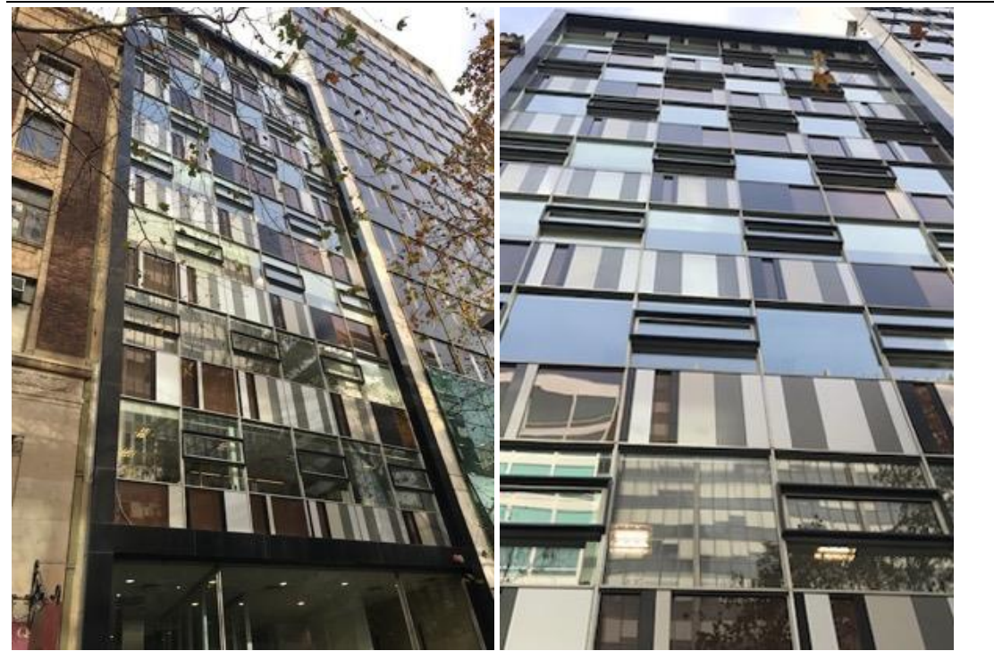
LITTLE BOURKE STREET