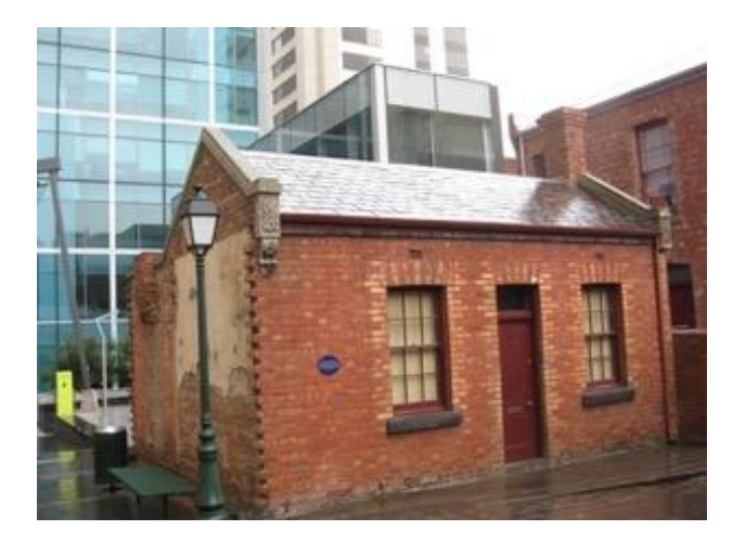
Figure 4. 17 Casselden Place constructed 1876.

Another very intact example of a modest early house is 17 Casselden Place, the only surviving one of six adjoining two-room houses built in 1876. The cottage is largely intact, with its original two rooms with original fittings and toilet and kitchen at the rear, and is on the VHR.