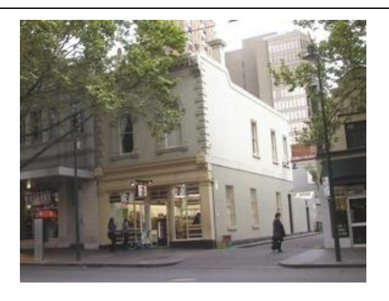
Figure 3. 35-37 Bourke Street constructed 1872.