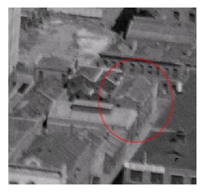
Figure 1. The boundary between the original 1870s rendered wall and newly added face brick part is clearly shown, from Aerial View of Melbourne, c.1945, by Victorian Railways (Source: SLV).

474 Little Lonsdale Street was damaged by fire in 1977, and restored and refurbished in 1990 to house a ground level bar and upper floor office (CAD study 1993; CoMMaps).