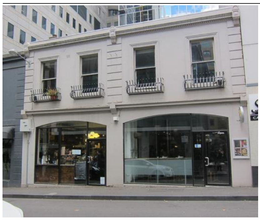
LA TROBE STREET