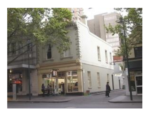
Figure 2. 35-37 Bourke Street constructed 1872.

Two-storey rendered brick shop. Designed in the Renaissance Revival style and built 1872 for J M Langley, a glass and china importer. From 1892 and 1969 it was used as a post office.