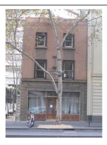
Figure 5. 74 Collins Street, former residence and surgery constructed 1855 and converted to a shop in 1927