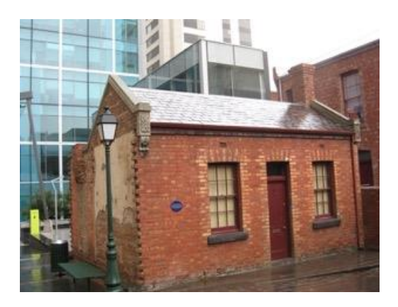
Figure 2. 17 Casselden Place constructed 1876.

An example of a modest early house is 17 Casselden Place, the only surviving one of six adjoining two-room houses built in 1876. The cottage is largely intact, with its original two rooms with original fittings and toilet and kitchen at the rear.