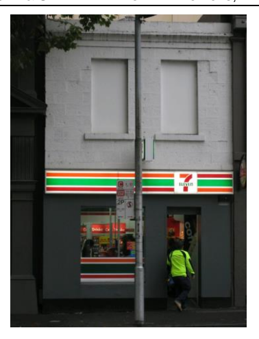
Figure 7. 261 William Street constructed 1856.

120-122 Little Lonsdale Street has the appearance of early housing from the 1850s but has been dated to the early 1870s. It is unusual for its residential appearance at ground level, not having been used as or converted to a shop. Although now altered to become one house, it is still legible as a pair. No.17 Casselden Place corresponds to the same period of construction to 120-122 Little Lonsdale Street. Like 261 William Street and 74 Collins Street, 120-122 Lonsdale Street provides a demonstration of living in the city.