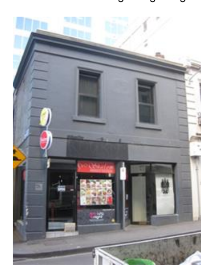
Figure 4. 474 Little Lonsdale Street constructed 1879.

This two-storey building built in 1879 on the corner of Little Lonsdale and Park Street was originally one of a pair of houses built to face Park Street. Substantial changes occurred in the 1920s resulting in this corner building being merged into a new brick factory that was built along Park Street.