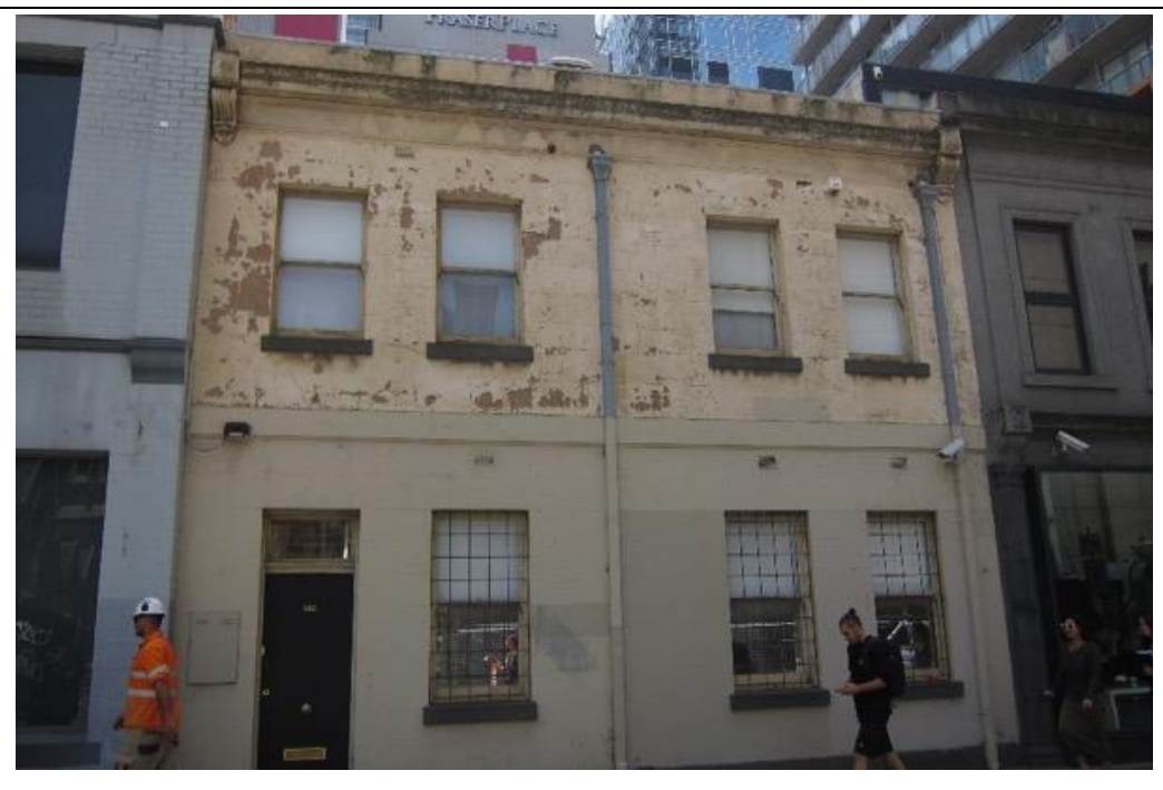
RUSSELL STREET DAVISONS PLACE (C.L.77) LITTLE LONSDALE STREET