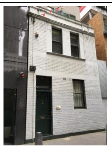
Figure 3. 20 Ridgway Place constructed 1896.

474 Little Lonsdale Street, c1870s (Interim HO1282 – recommended as significant in the Hoddle Grid Heritage Review)