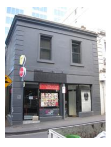
Figure 1. 474 Little Lonsdale Street constructed 1879.

This small two-storey building built in 1879 on the corner of Little Lonsdale and Park Street was originally one of a pair of houses built to face Park Street. While the building has undergone substantial changes to its use, orientation and appearance, it still retains the early residential form and elements of the mid-Victorian detailing to its upper façade.