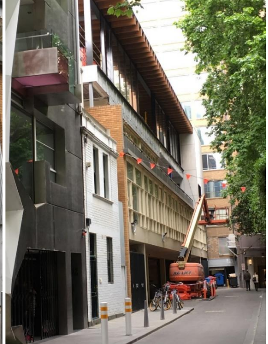
EXHIBITION STREET COLLINS STREET COLLINS STREET