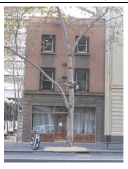
Figure 2. 74 Collins Street, former residence and surgery constructed 1855.

215-217 Swanston Street, 1856 (Interim HO1291, Significant in Interim HO1288 Swanston Street North Precinct – recommended as significant in the Hoddle Grid Heritage Review)