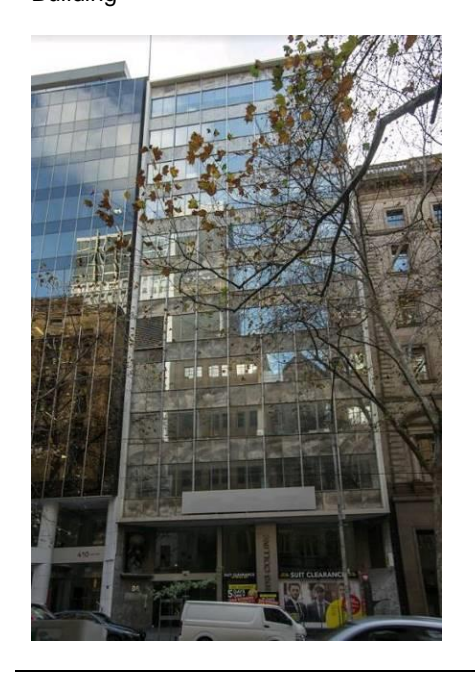
Heritage Place: Former Atlas Assurance Building