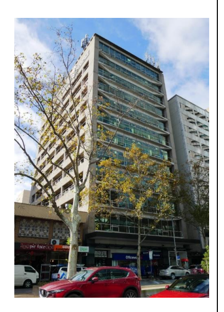
Heritage Place: Former Australia Pacific House