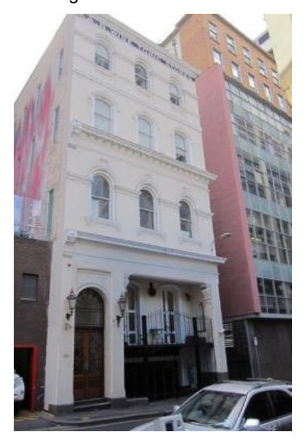
Heritage Place: Former Gordon Buildings