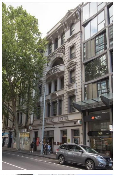
Heritage Place: Former Markillie's Prince of Wales Hotel