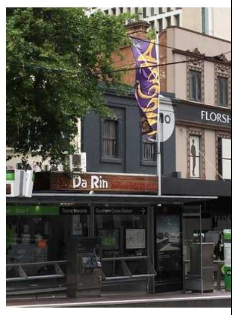
Heritage Place: Shop