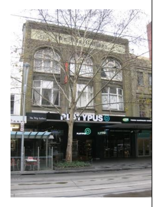
Heritage Place: Sanders and Levy Building