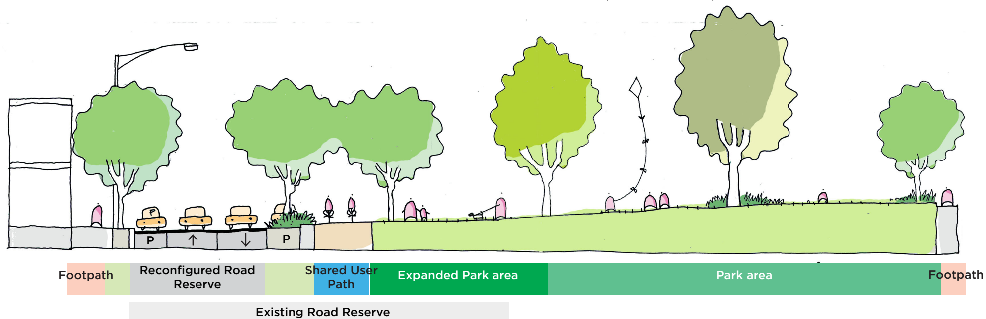
SECTION BB NEW EXPANDED PARK AREA BETWEEN SPENCER AND KING STREET (NOT TO SCALE)

We're inviting you to provide feedback via the Participate Melbourne website at participate.melbourne.vic.gov.au/hawke-street-linear-park . The consultation period concludes on Sunday 25 April 2021.