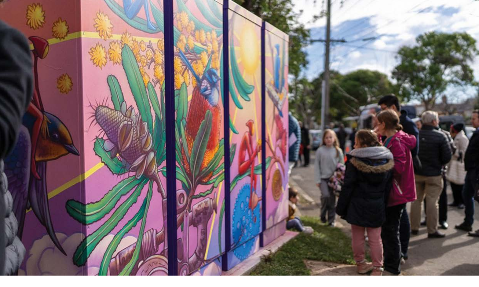
The 284kWh battery developed by Yarra Energy Foundation in Fitzroy North was supported by CitiPower who acted as a delivery partner. The battery is now servicing an estimated 200 homes and was designed to deliver both environmental outcomes and financial sustainability by participating in the wholesale electricity market.