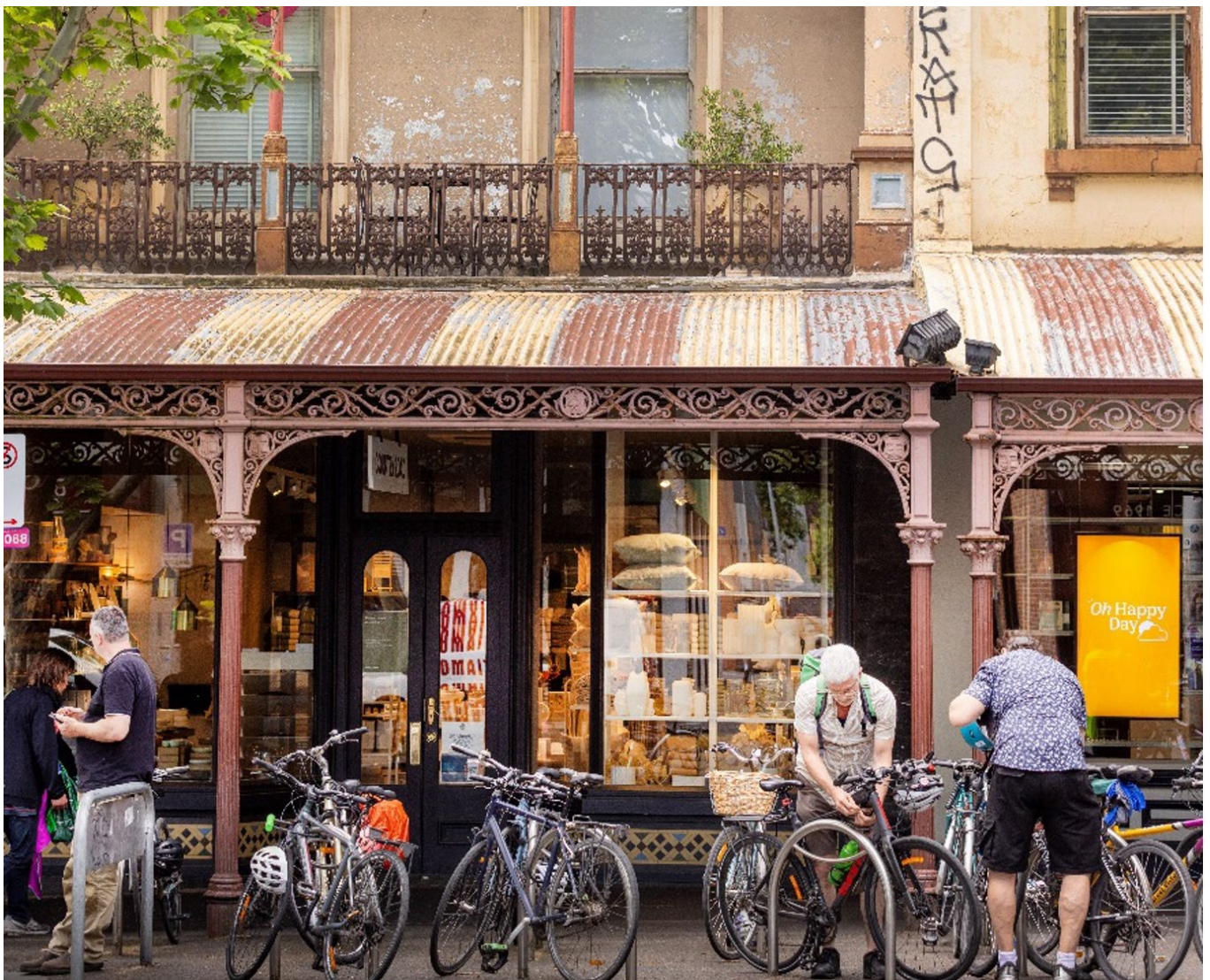
Image 1 People parking bikes at a heritage shopfront on Lygon Street, Carlton