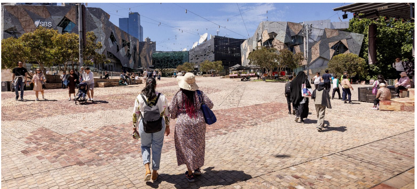
Image 1 People walking through Fed Square

Heritage is dynamic and changes with our society over time. It is at the heart of community identity and helps sustain Melbourne's rich and diverse communities. It is an essential part of the present we live in and the future we will build. It is passed on to us and it is the inheritance we pass on to future generations.