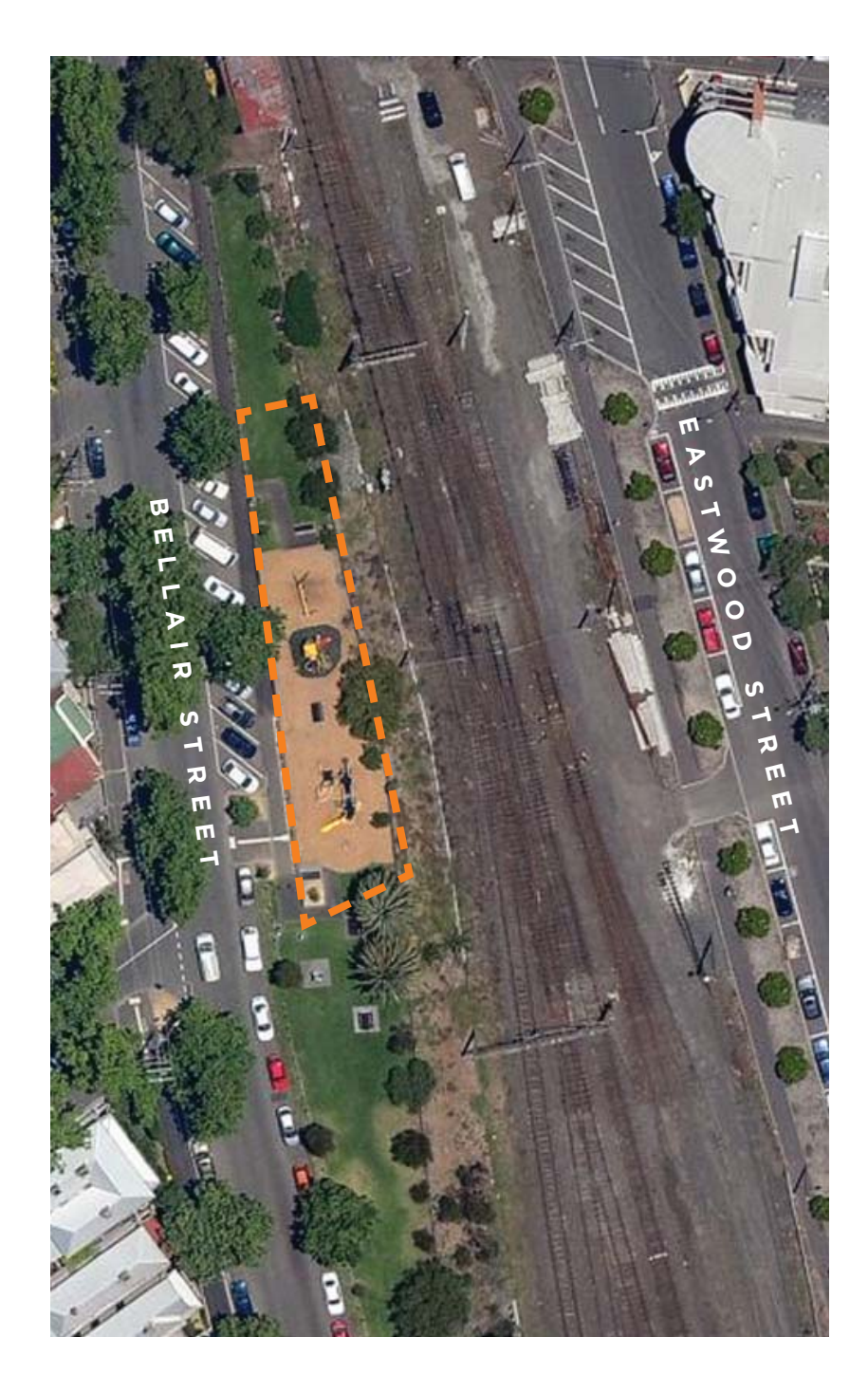
Existing Site Aerial