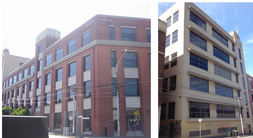
Figure 6 Former Myer dispatch buildings, 11 and 31-47 Barry Street Carlton. They have site specific Heritage Overlays and are proposed for significant grading under Amendment C258.