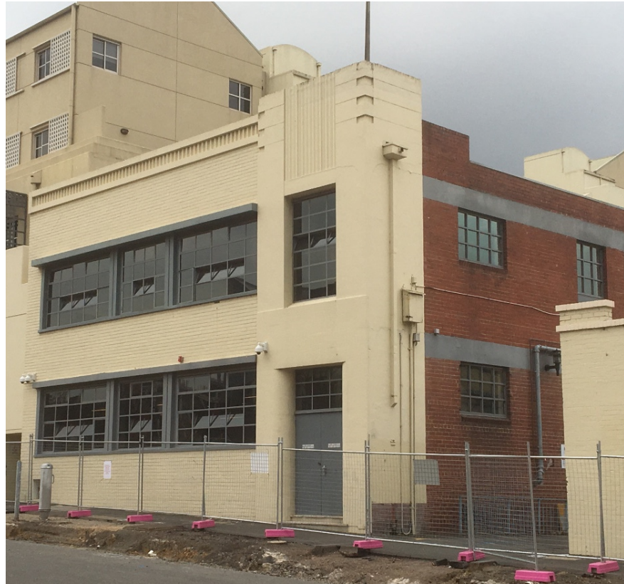
Figure 2 Current photograph of the Leicester Street façade.