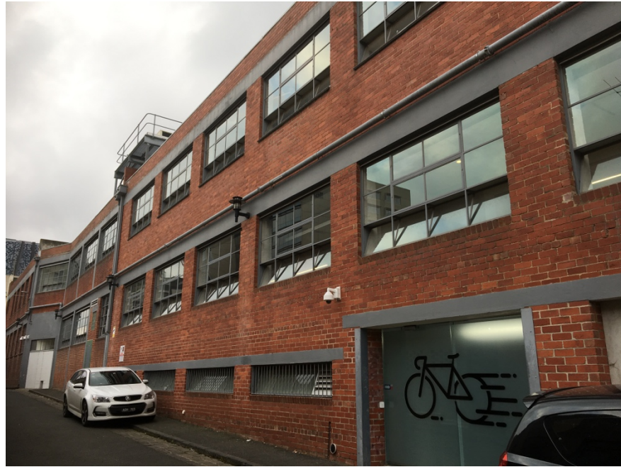
Figure 4 The Little Pelham Street elevation a showing the c1964 additions in the foreground.