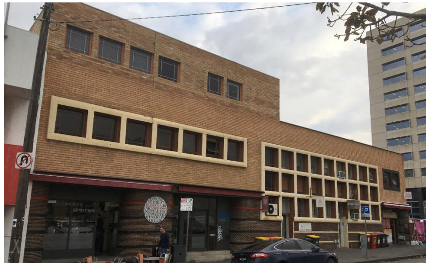
Figure 5 Former C Huppert & Co Factory, 157-165 Pelham Street, Carlton. Originally D graded, it was regraded C3 as part of Amendment C198 and given an individual HO listing. Proposed for a significant grading under Amendment C258.